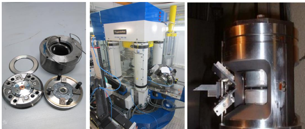
Figure 2 Shows examples different high pressure device types in use at synchrotron and neutron sources; a) a membrane-driven diamond-anvil cell, b) a four-column 20MN large-volume multi-anvil press and c) a VX Paris-Edinburgh press with collimator and shielding for neutron scattering studies.