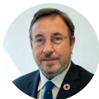
Achim Steiner Administrator United Nations Development Programme (UNDP)