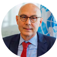
Volker Türk United Nations High Commissioner for Human Rights Office of the United Nations High Commissioner for Human Rights (OHCHR)

The triple planetary crisis of climate change, biodiversity and nature loss, and pollution is increasingly affecting the human rights of people across the globe. From climate change induced drought that is precipitating hunger and famine around the world, to pollution that is contaminating water sources everywhere, the global environmental crisis is disproportionately impacting the world's most marginalized communities.