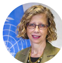
Inger Andersen Executive Director United Nations Environment Programme (UNEP)