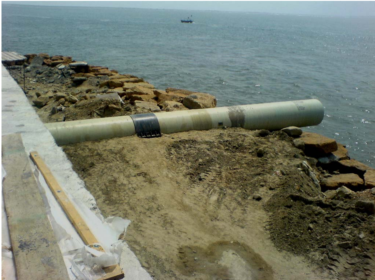
Brine outfall pipe at desalination plant.

Brine, along with the chemicals used to prevent fouling and scaling, must be disposed of by desalination facilities. The disposal of these wastes is just one of the major environmental concerns about desalination. These concerns, and others, are discussed in the next section, Environmental Concerns .