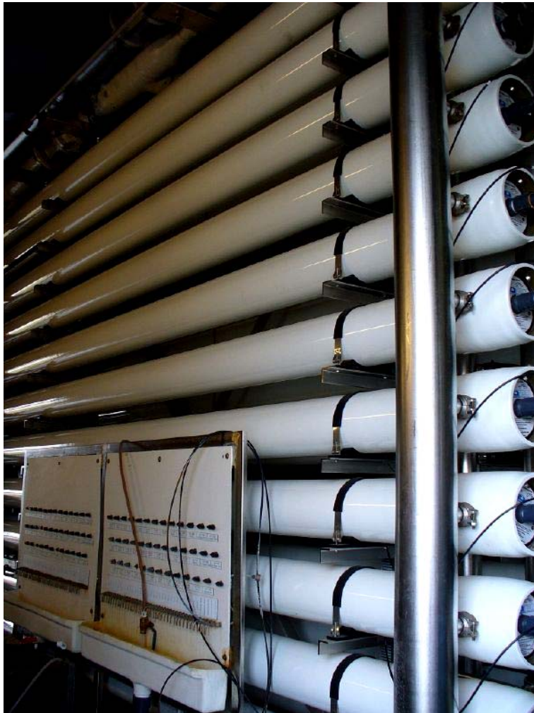
Racks of high pressure filter tubes at Lower RioGrande plant.

Using desalinated water can also result in behavioral changes. The perception of the ocean as a source of water supply may result in increased public awareness and protection of oceans. Also, the higher costs of desalinated water may make less expensive water conservation alternatives much more attractive (California Coastal Commission, 2004).