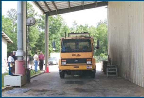
Figure 6. Truck wash facility, with open, roofed structure. The berm prevents the wastewater from running off the wash pad.

these larger particles can be enhanced by mounting a series of weirs within the drain trench, normally along the center of the wash bay. The loss of water through carry out is high. For example, a tractor-trailer can carry out of the wash bay up to 40-50 gallons of water on the vehicle and on top of the trailer. The options for containing and recycling the wash water can vary as depicted in the pictures below.