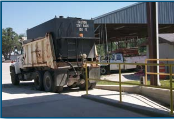
Figure 24. Pumpout truck used to remove the sludge from the settling tank at this facility.

Plate and frame filters, pressure sand filters, mixed media filters, and pressure leaf filters can be used in car wash operations for final rinse water treatment. Particles larger than 40 microns must be removed from the recycled water to prevent equipment wear and abrasions on car finishes.