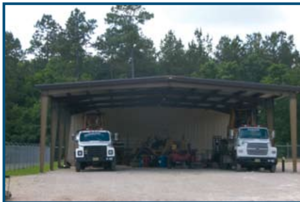
Figure 23. At this facility heavy equipment is completely covered for protection from the inclement weather, and also to prevent runoff contamination. If a roofed structure is not feasible, at least the dirty portions of the equipment should be covered.

If heavy equipment is stored at the facility, the dirty portions of the equipment should be covered when not in use, to control runoff contamination.