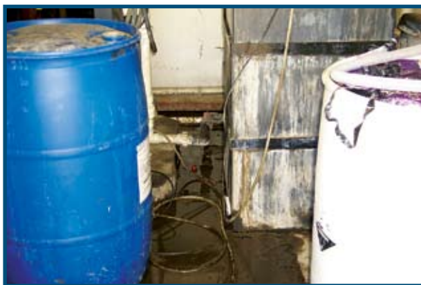
Figure 25. The recycling system at this facility is enclosed and it is therefore protected from stormwater intrusion. The liquid on the floor indicates a spill or leak. This situation must be corrected.