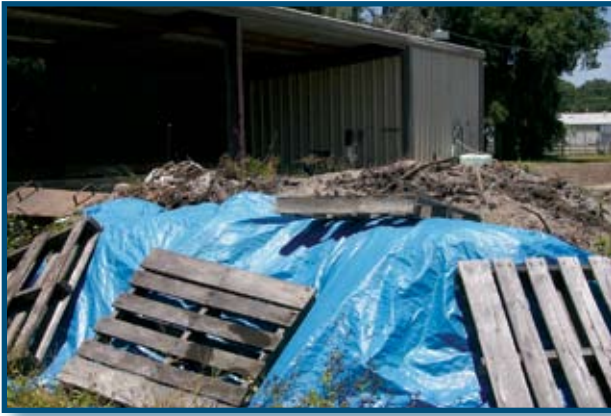
Figure 21. Example of improper handling/storage of solids. An attempt was made to cover the pile with a tarp; however the coverage is not complete, so the rain water can wash and carry away solids from the pile.