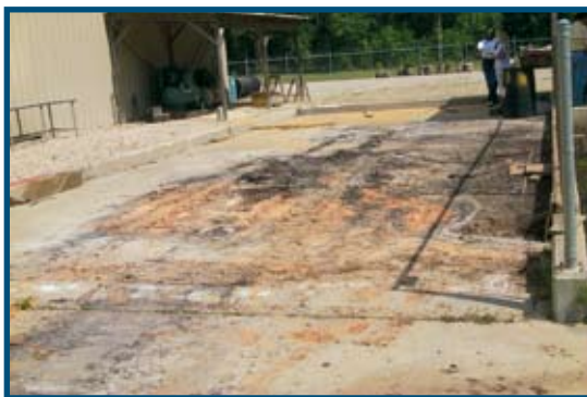
Figure 16. The rain falling onto this wash pad can be diverted to the stormwater sewer via a removable rain water dam. This prevents the recycle system from overflowing due to excess volume. The wash pad must be thoroughly cleaned before diverting the rainfall off the pad and into the storm sewer.