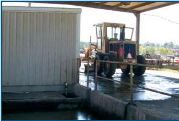
Figure 7. Covered concrete wash pad. Wastewater collects into the adjacent pit via the gate.