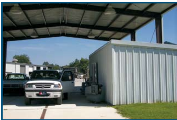
Figure 8. Example of heavy equipment washing facility equipped with a 100% closed-loop recycle system.