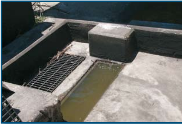
Figure 18. The wash pad at this facility is equipped with a stormwater diversion valve.

If the system is equipped with a stormwater diversion valve, the following procedures must be followed to insure proper results: