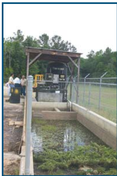
Figure 17. This facility does not have a roof or other cover over the wash area. As a result, excess stormwater occasionally creates an overflow of wastewater into the stormwater pond adjacent to the system. This is not a desirable situation.

If a wash pad can not be covered with a roof for various reasons (including cost), another way to prevent stormwater from overflowing the system, is to install a stormwater diversion valve. This allows the system to discharge uncontaminated stormwater runoff from the wash pad to an appropriate stormwater outfall when the pad is not in use.