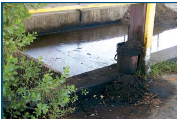
Figure 19. The solid waste collected from the settling pit is improperly stored in an open bucket. The waste should be stored in a closed container until ready to be sent to a class I or II sanitary landfill.

or sumps from overflowing. Used filters and other solid waste must be stored in covered containers until ready to be sent to a landfill.