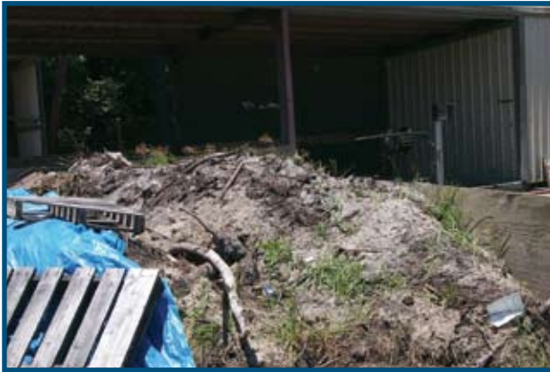
Figure 22. Example of improper handling of solids. Solids should be stored on an impervious surface, well covered, with no exposure to rain.