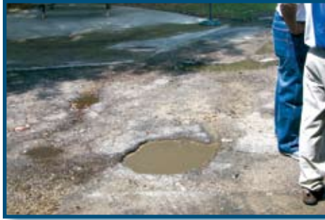
Figure 14. Dirty water in this puddle just outside the car wash tunnel indicates some car washing took place outside the wash tunnel, allowing dirty water to run onto the ground instead of into the collection pit.

Do not pre-wash, wash, or rinse vehicles outside or away from the wash area, to prevent wash water discharge to the ground or surface waters.