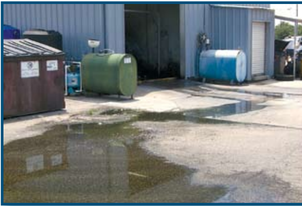
Figure 9. The rinse water at this car wash facility is allowed to collect on site, creating nuisance conditions.

The wash site must be designed with proper curbing and sloping to ensure that neither stormwater nor wastewater will pond at the site, flood the adjacent property, or create nuisance conditions (severe odors, etc).