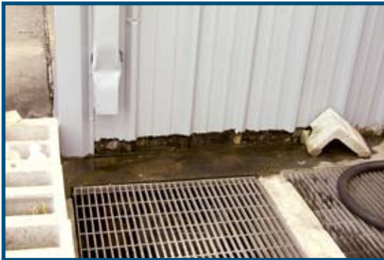
Figure 15. The collection pit at this car wash facility is located outside, adjacent to the wash tunnel. The pit is not covered, there is no overhang, and the downspout brings rain water right into the pit. This situation must be corrected.

Do not allow intrusion of stormwater into the recycle system. Install overhangs, roofing, or other devices on buildings. Also, install curbs around wash bays or tunnel entrances (or elevate bays or tunnels) as appropriate. This will avoid the overloading of the system's storage capacity, and the potential to cause a discharge.