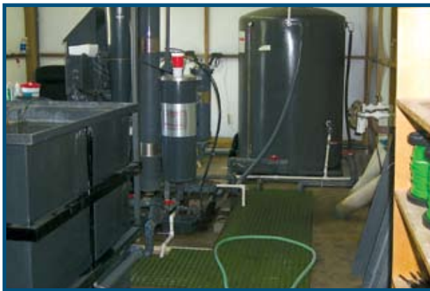
Figure 27. Example of good housekeeping.