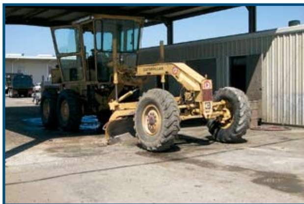
Figure 10. The wash area at this facility is large enough to accommodate the size of the heavy equipment being cleaned. However, this unit is placed too close to the edge of the wash area, allowing wash water to run off the pad.

It is recommended to enclose the washing areas with walls to prevent the dirty overspray from leaving the area. Also, the floors should be properly graded to allow the wash water to drain into the collection pit or sump.