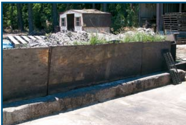
Figure 20. Example of improper storage of solids. The material is not completely covered and as a result, the rain water can wash it away.

If it is not practical to store material awaiting disposal in closed containers, the material should be well covered with a tarp to prevent stormwater contamination.