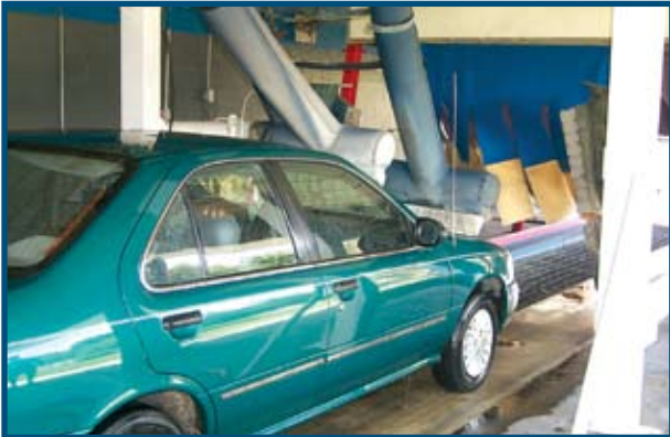
Figures 2, 3 and 4. Examples of a tunnel car wash.