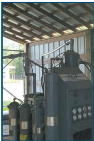
Figure 13. Example of a 100% closed-loop recycle treatment unit installed in an enclosed space to prevent rainwater from getting in, as well as, to prevent unwanted tampering with the control panel.

When problems occur (i.e., an unanticipated bypass, upsets in the system, an unauthorized discharge to surface or ground waters), DEP or the POTW authority, if the discharge is to a permitted wastewater treatment facility, should be notified. For unauthorized releases or spills of untreated or treated wastewater that are in excess of 1,000 gallons per incident, or where information indicates that public health or the environment will be endangered, oral reports shall be provided to DEP by calling the STATE WARNING POINT TOLL FREE NUMBER (800) 320-0519, as soon as practical, but no later than 24 hours from the time the facility becomes aware of the discharge. A detailed written report (describing the problem, remedial measures taken, and steps implemented to prevent the problem from happening again) may also be required at a later stage.