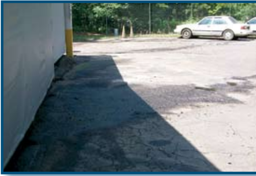
Figure 12. Outside view of the same facility. Because of the improper containment, the wash water runs outside, off premises, and onto the ground.

Washing areas should not be located near uncovered vehicle repair areas or chemical storage facilities, to prevent the transport of chemicals in the wash water runoff.