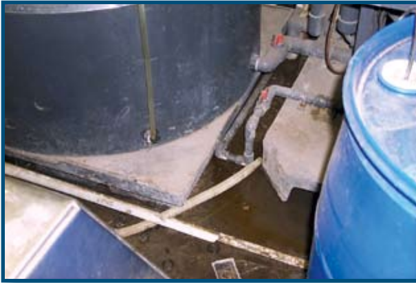
Figure 26. Scattered pieces of different materials in a puddle of liquid on the floor are signs of poor housekeeping. Poor housekeeping creates safety hazards, as well as operational problems.