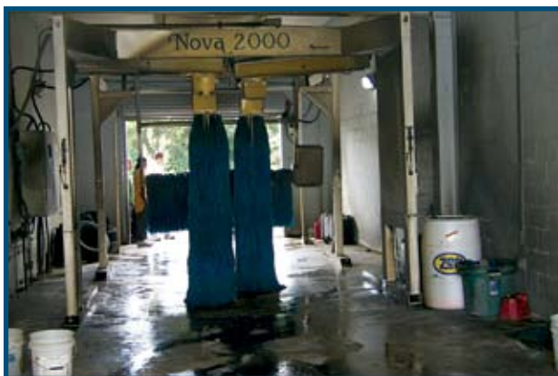
Figure 1. Example of a rollover car wash. The wash water is well confined inside the system. Also, no significant amount of rainwater is introduced into the system.

In-bay automatic car washes often use friction and/or pressure along with chemicals to achieve a good wash. Brush-type automatic car washes use 30 to 45 gallons of water per car, with a lower amount of chemicals. This water can be reused with minimum treatment. Touch-free automatic car washes consume a comparable amount of water per car, but require an increased amount of chemicals to achieve the same degree of cleaning. As a result, additional treatment steps are necessary before reusing the water.