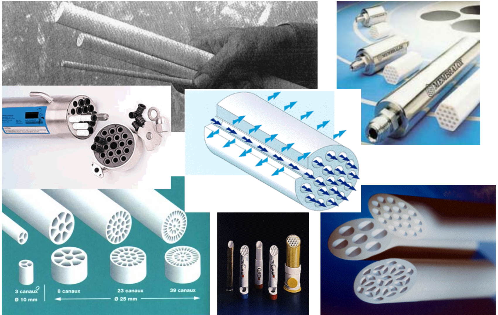
Different types of tubular modules.